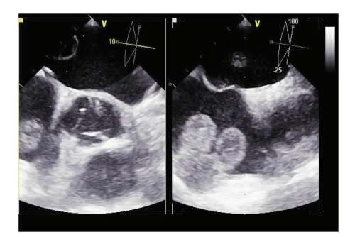
Figure 3: Transesophageal echocardiogram of the mass in the right atrium.