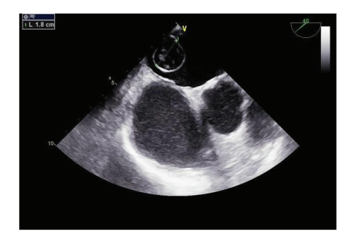
Figure 1: Transesophageal echocardiogram of the mass in the left atrium.