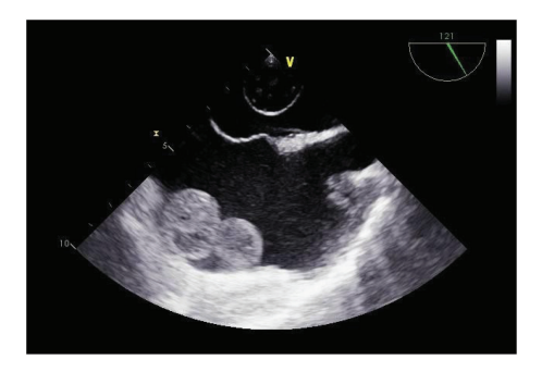
Figure 5: Transesophageal echocardiogram of the mass both in the right and left atria.

Figure 4: Tridimensional transesophageal echocardiogram of the mass in the right atrium.