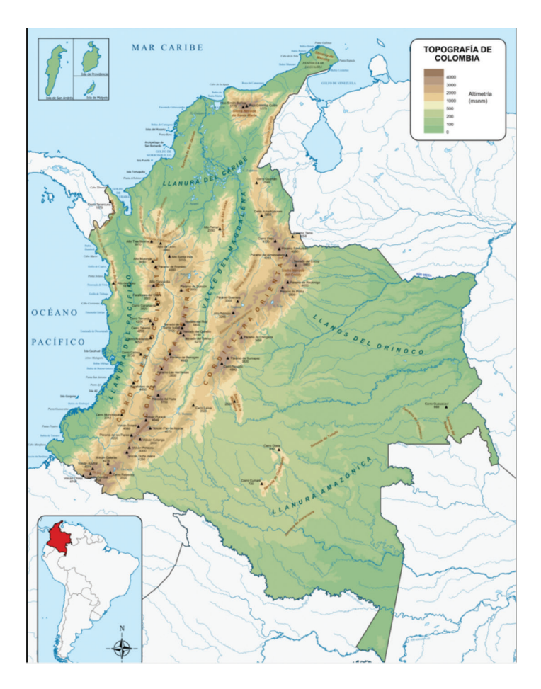
Figure 2. Topographical map of Colombia [4].

The country has a population of 51 million people, [5] of whom 13 million are under 18 years of age [6]. According to its Constitution, the country is multi-ethnic and multicultural, with 84.2% of the population self-identifying as Mestizo, 10.5% as Afro-Colombian, and 3.4% as indigenous [7]. Around 40% of the population lives in poverty, which is exacerbated in areas of high rurality [8].